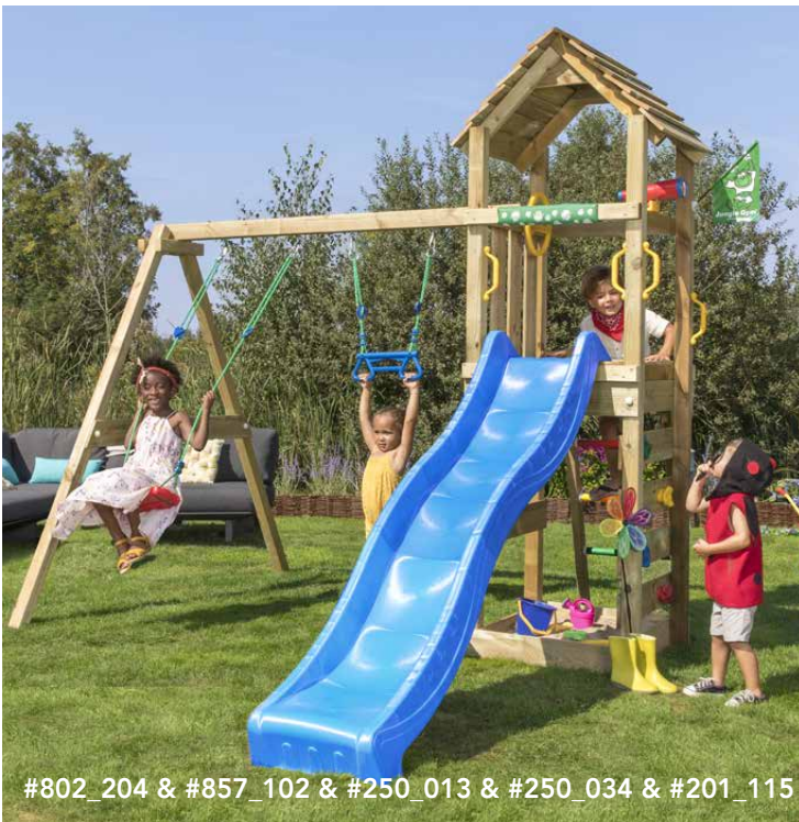
#802_204 & #857_102 & #250_013 & #250_034 & #201_115